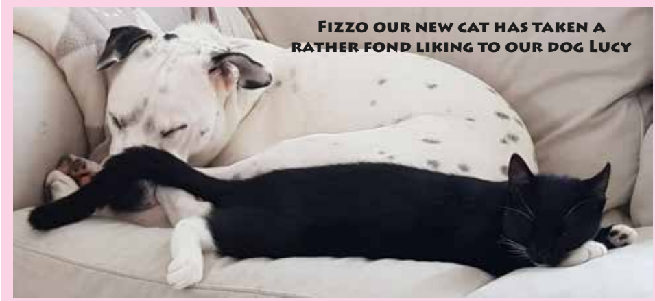
FIZZO OUR NEW CAT HAS TAKEN A RATHER FOND LIKING TO OUR DOG LUCY