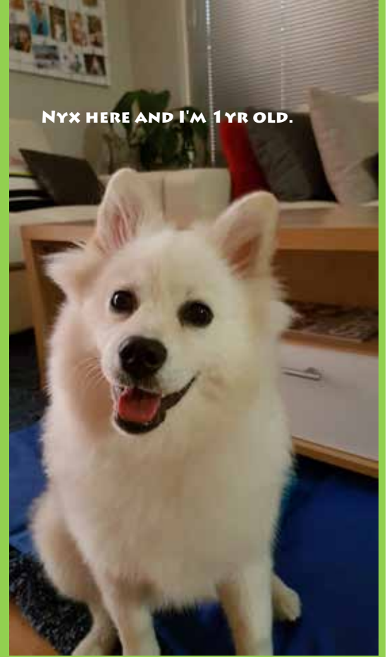
NYX HERE AND I'M 1YR OLD.