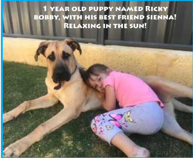
1 YEAR OLD PUPPY NAMED RICKY BOBBY, WITH HIS BEST FRIEND SIENNA! RELAXING IN THE SUN!

Email your pet picture to ldurston@banksiagrove.com.au . The cutest pet wins a free dog groom from Steph's Doggy Day Spa!