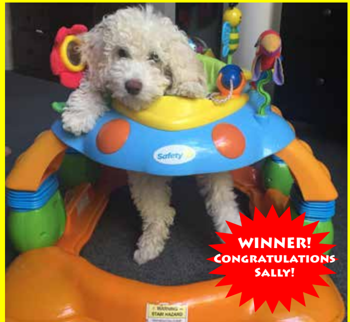
This is Sally our 3 month old Labradoodle that my daughter calls 'baby' and is treated like one! If it is not the baby walker it is the baby pram :-)