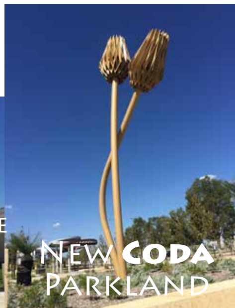
NEW CODA PARKLAND