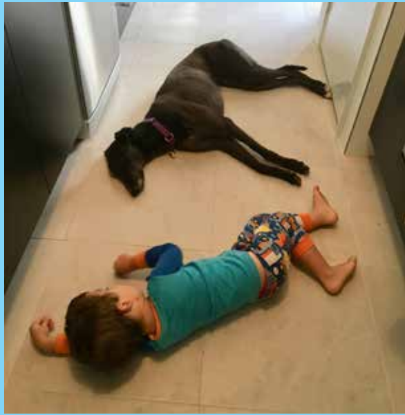
Chico is retired from racing and is now enjoying the fam life