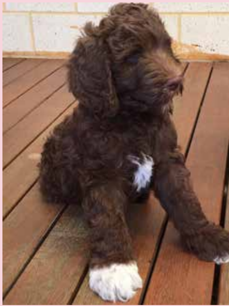
Our 10 week old furbaby Charlie

Email your pet picture to ldurston@lwpproperty.com.au . The cutest pet wins a free dog groom from Steph's Doggy Day Spa!