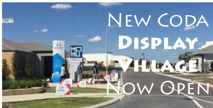
NEW CODA DISPLAY VILLAGE NOW OPEN