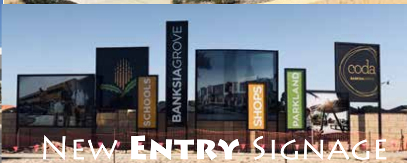
NEW ENTRY SIGNAGE