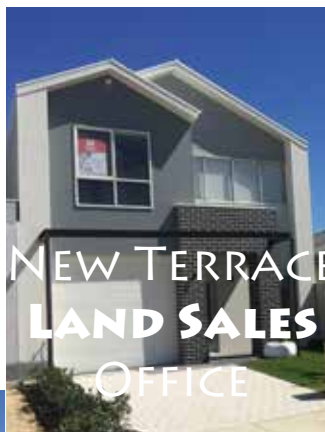
NEW TERRACE LAND SALES OFFICE

For more information on the development or land sales call Tony on (08) 9485 1100 or visit banksiagrove.com.au